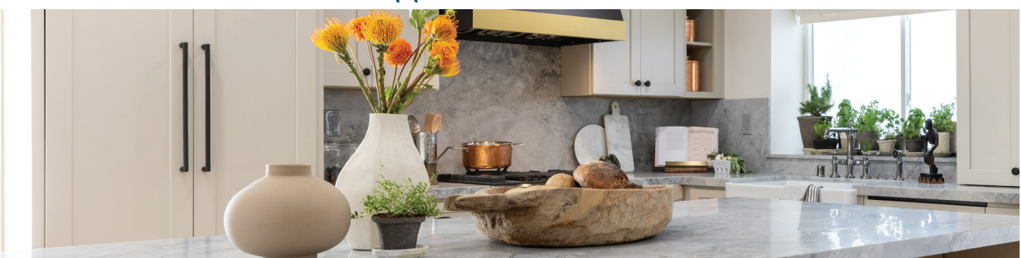
KCD's Decorative Appliance Collection is designed to provide the perfect complement to our cabinet door hardware.