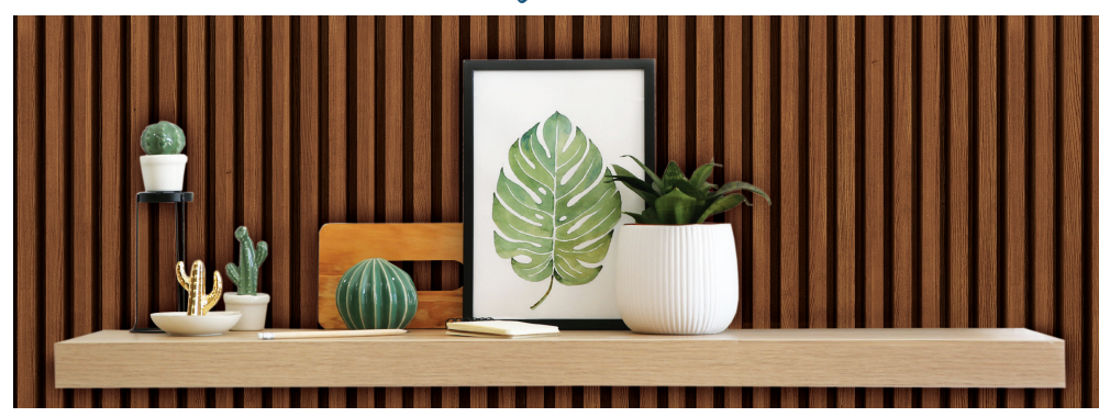
KCD offers Floating Shelves for accents to add beauty and function to your kitchen or bathroom.

Our floating shelves come in three finishes and five different sizes. Easy to install and designed to be durable for a lifetime of use, floating shelves add the perfect finishing touch to your space.