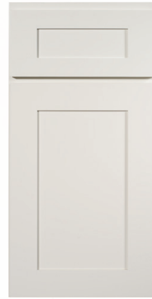
SHAKER DESIGNER WHITE 5 Pc.