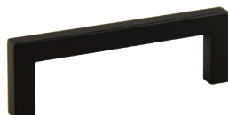
Modern Square Pull