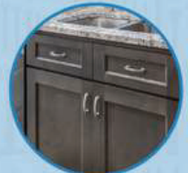
ROLL OUT TRAY