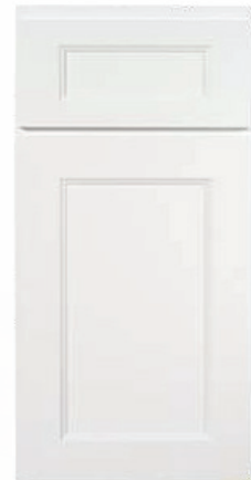
BROOKLYN BRIGHT WHITE