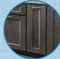
BASE WITH SPICE RACK