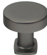
Round Flat Top Knob