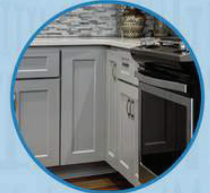
EASY REACH CABINET