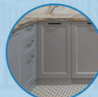
TRASH CAN BASE