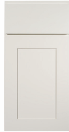
SHAKER DESIGNER WHITE Slab