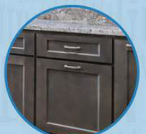
TRASH CAN INSERT