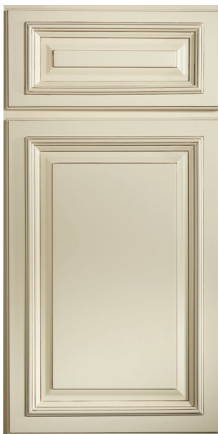
LENOX COUNTRY LINEN