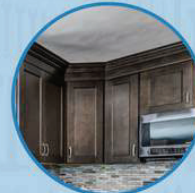
CORNER WALL CABINET