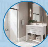
OPEN SHELF VANITY